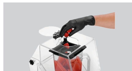
► Opening for filling shaft ✓ With cover flap