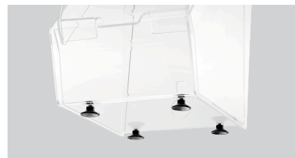
► Secure stand ✓ 4 suction pads