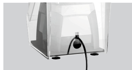
► Opening for cable outlet