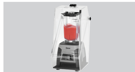
► Suitable for Blender PRO 2.5L