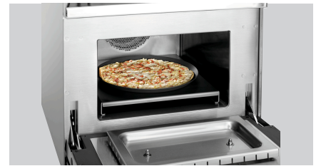
▶ Designed for the Snackjet 200