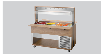
► Buffet cart for cold food